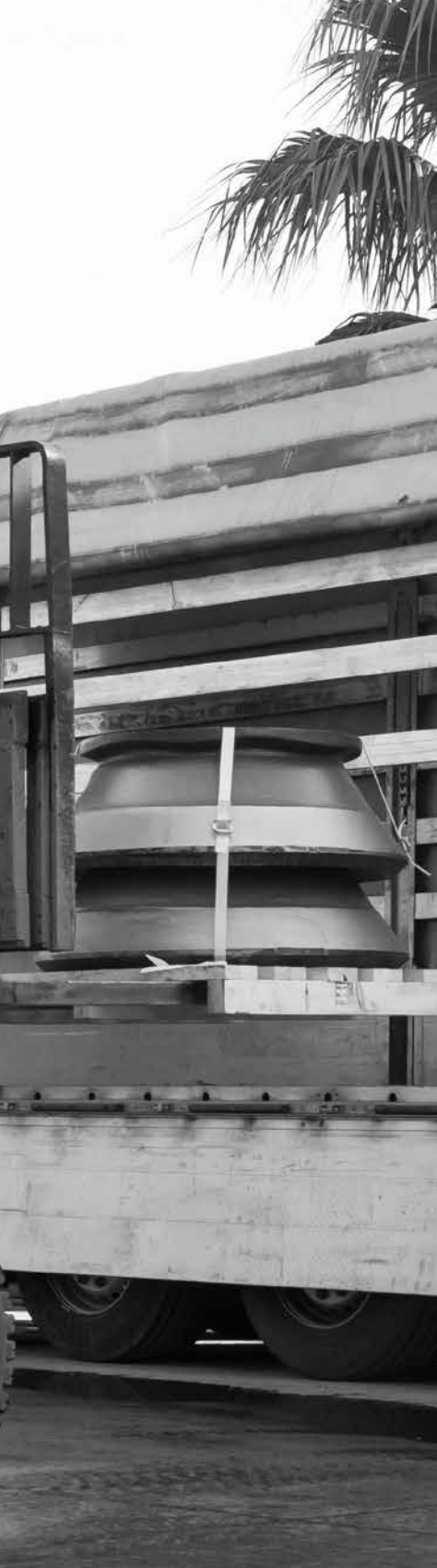
Net Casting Quantity (Tons) between years 2018 and 2021